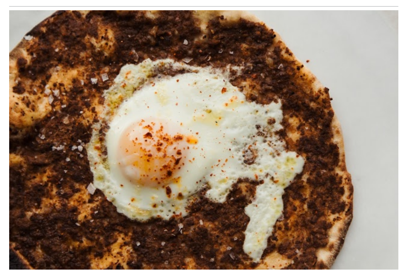
Lahm bi-ajeen with egg